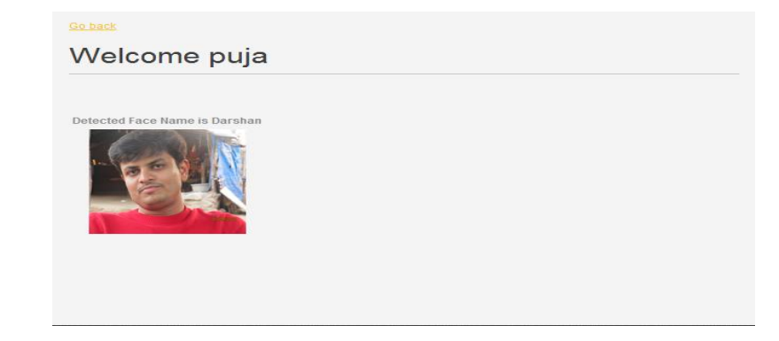
Figure 4 Output