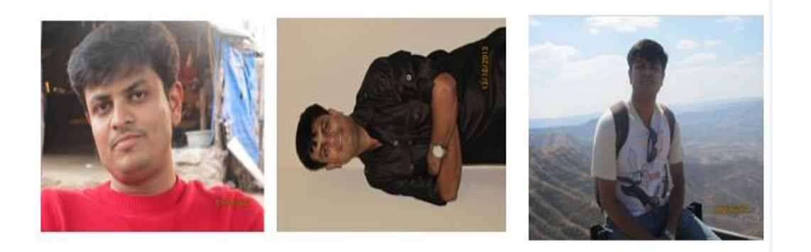
Figure 3 Input image

(A High Impact Factor, Monthly, Peer Reviewed Journal) Visit: <u>www.ijirset.com</u> Vol. 7, Issue 6, June 2018